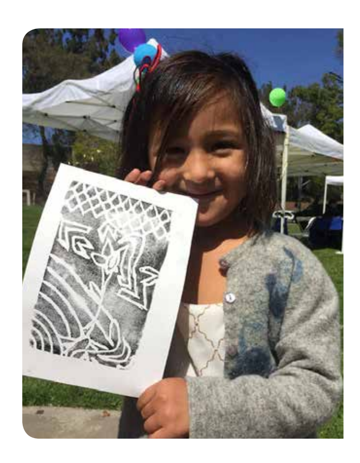
A young girl proudly displays a print made during the printmaking workshop at SaludArte .

• Artists have to be fully informed about BHC priorities, community issues and brought more into the fold of the BHC initiative. In several instances, artists reported desiring greater connection, better information and more awareness about BHC campaigns and the initiative in general. They also desired a more collaborative relationship with BHC in designing programming. Several artists expressed that they care about the community and the issues BHC is tackling and want to be part of community change in a thoughtful way. They want their work to be more integral—not seen only as a workshop for hire or delivery of a product. Some also expressed that they would like more feedback from BHC about their work as well as opportunities to discuss it.