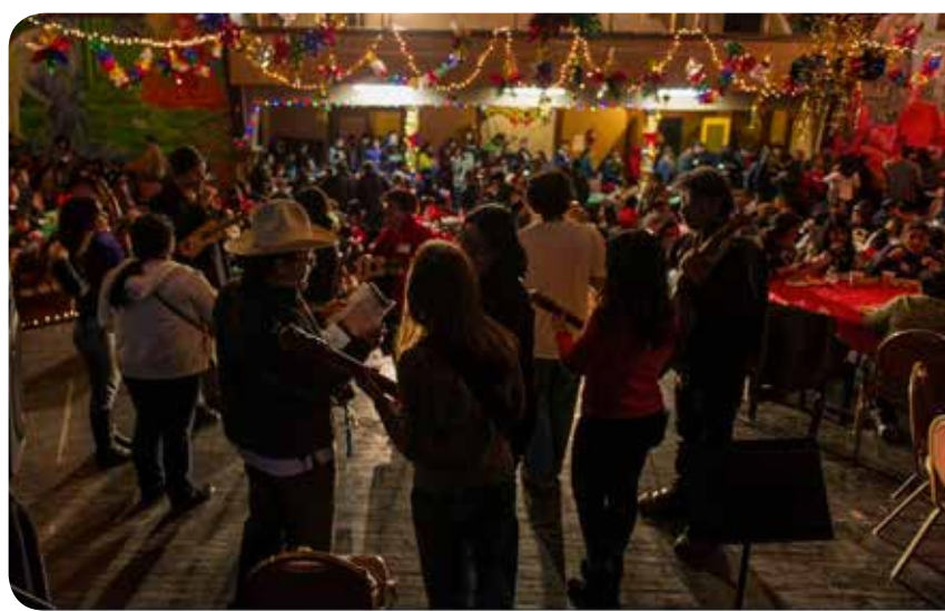
Son Jarocho music workshop participants supporting East Los Angeles Community Corporations' community posada in support of Los Angeles street vendors.

For the workshop series, ACTA contracted three master artists to facilitate arts and cultural workshops and tasked them with incorporating Boyle Heights BHC campaign themes into their curriculum. ACTA's work included carefully considering the match between the BHC's goals and the artist, the art form, and location of workshops. It also required screening carefully for artists that had the appropriate experience, expertise and nimbleness necessary when working in low-income community settings with families that are often under many pressures. Additionally, ACTA also worked carefully to help the artists navigate BHC processes and information.