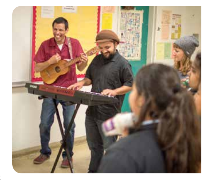
Collective songwriting workshop with local Boyle Heights youth.

same person might be open to watching a play about it. It can be an important way in and creates an opportunity for deeper engagement in the future.