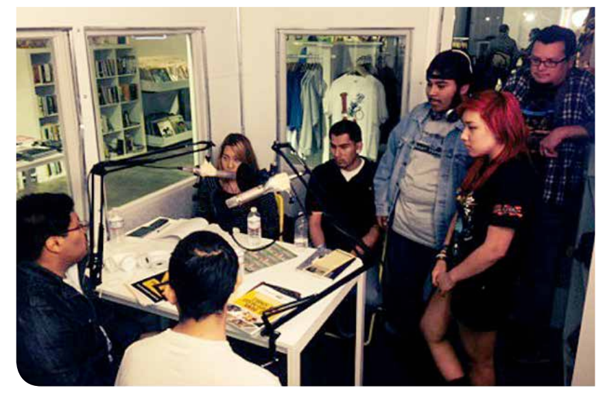
Restorative Justice Pilot Radio students at radio workshop at Espacio 1839, a local community music book store and collective that houses community radio station, Radio Sombra.