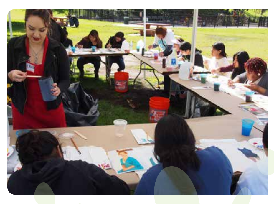
Arts workshop at SaludArte, a day-long arts, culture, and health festival coordinated by ACTA and BHC Hub partners.

The focus of the arts elements proposed by ACTA staff in conversation with workgroup co-chairs—reinterpretation of rooms in the facility as art spaces with BHC campaign themes and other arts activity to re-interpret the space began to be questioned by a larger BHC group that was more in favor of focusing on increasing enrollment numbers and disseminating traditional campaign information to participants. Workgroup participants concerned with these priorities began to question the fit of songwriting workshops with BHC enrollment and campaign goals and posited that the arts activity might even be confusing to participants.