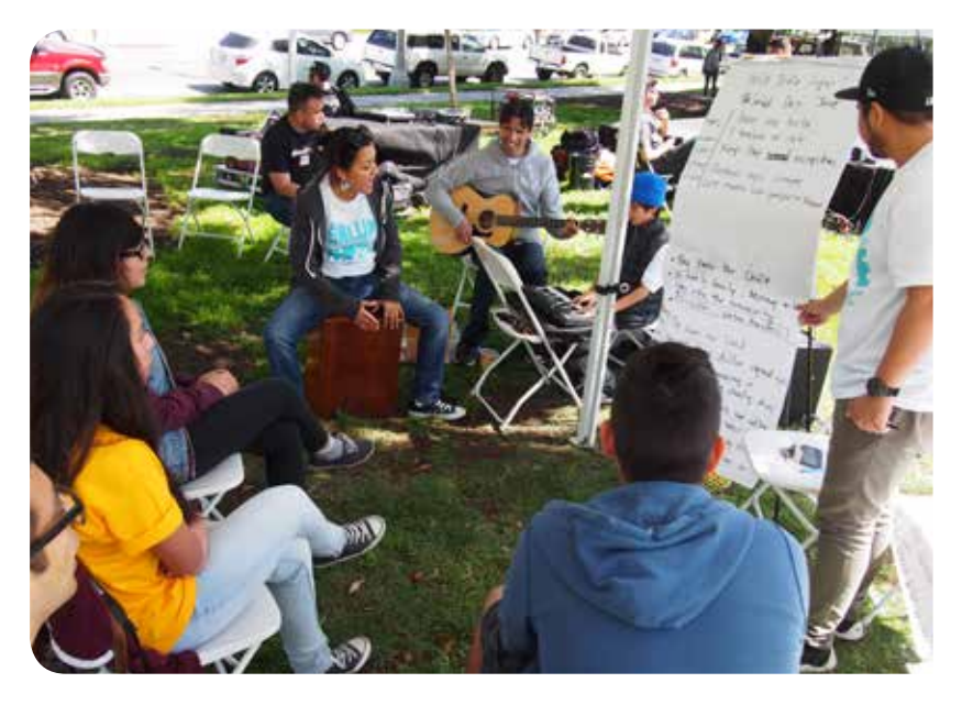
Collective songwriting workshop at SaludArte festival facilitated by local band, Quetzal, members.

Respondents noted in a few instances that, despite ACTA's efforts and contact with BHC staff and given the complexity and evolution of the issues addressed through BHC, more information and opportunities to engage the issues prior to the workshops would have been helpful. Some respondents also noted the importance of understanding what the workshops offered beyond direct impact on policy issues, primarily in terms of messaging. They called attention to the need to also recognize and emphasize the importance of personal transformation and the deliberative process of participants arriving at their own understanding of community and policy issues through exploration of personal feelings and experiences as revealed in creative process.